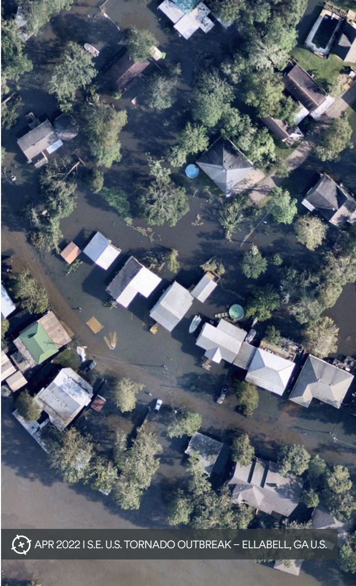
APR 2022 | S.E. U.S. TORNADO OUTBREAK – ELLABELL, GA U.S.