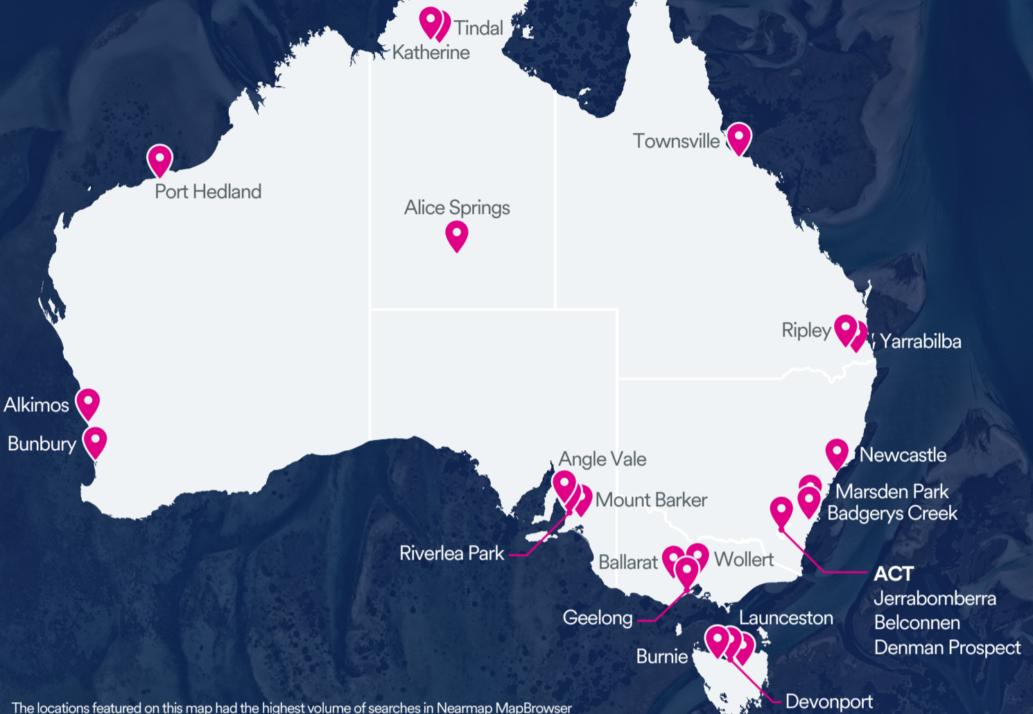
The locations featured on this map had the highest volume of searches in Nearmap MapBrowser between 1 Jan 2023 to 30 Oct 2023, excluding capital cities and airports.